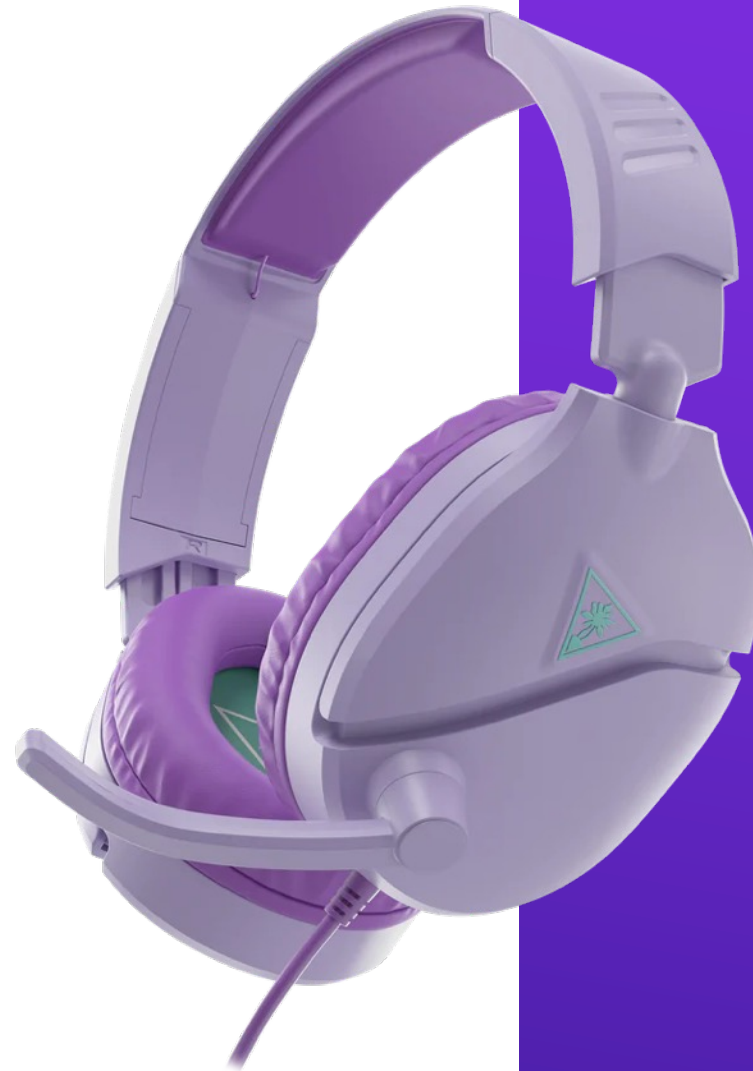
Recon 70 Colorways