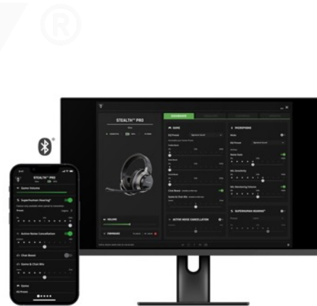
App-based Audio Customization for Mobile & Desktop