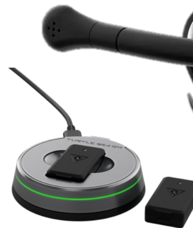
Includes Two Swappable 12-Hour Rechargeable Batteries